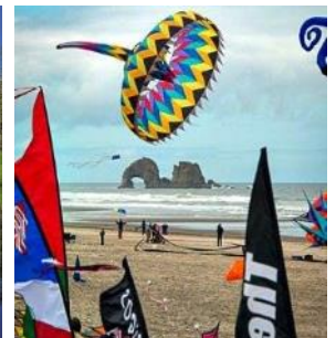
Rockaway Beach kite festival