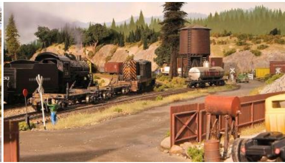
Bear Creek & South Jackson (HO)