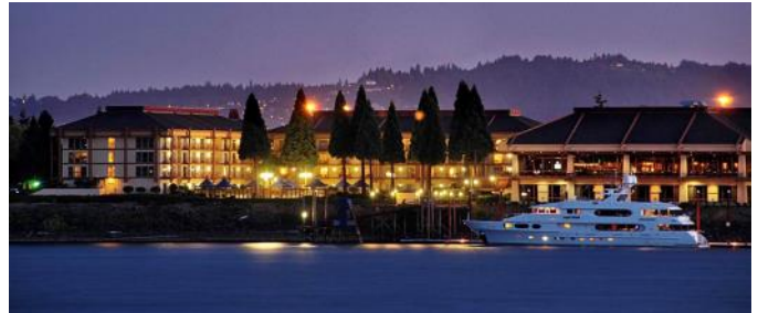
Convention Hotel

Rooms at the convention hotel, the Red Lion Hotel on the River at Jantzen Beach, are still available ( http://www.stumptown2018.org/pnr2018.html#hotel ) at the special convention rates of $109 and $119 per night. The hotel is extending this rate both before and afterward so that you and your family can take in more of what Portland has to offer. The hotel is right on the Columbia, with many rooms overlooking the water and the BNSF mainline over on the Washington side of the river. It is located just off Interstate 5 and north of Interstate 84, so it has easy access from anywhere in the Region.