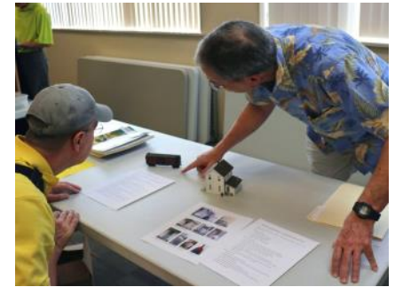
Model Contest

On Friday you can treat yourself with a trip to historic Pittock Mansion, a Portland attraction since 1965. The scenic views from the grounds are spectacular. After breathing in the grandeur of the house and the grounds, you'll be taken to a nearby restaurant for no-host lunch, and then on to the International Rose Test Garden in Washington Park. The beds should be a riot of color as this is, after all, during Rose Festival. (More on that shortly!)