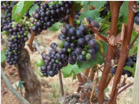
Pinot grapes growing in the Willamette Valley