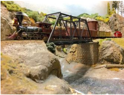
Pacific City & Northern Railway (HOn3)