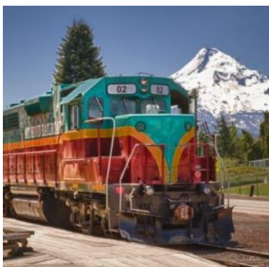
Mount Hood Railroad

On Saturday, if you aren't attending the Arduino Make & Take, how about you and your family going for a ride up the slopes of Mt. Hood on the Mount Hood Railroad ( https://www.mthoodrr.com/ )? This trip starts (and ends) with a drive