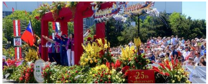
Float in Grand Floral Parade

This year our convention ends as Portland's premier event, the Rose Festival ( http://rosefestival.org ) gets started. Stay for the next week to enjoy Fleet Week, when ships from the US and Canadian navies dock right at the downtown seawall; the Junior Parade with floats and displays made by local children; and City-Fair a full carnival on the banks of the Willamette River. The week culminates on Saturday with the Grand Floral Parade winding its way through downtown. Most events are easily accessible via MAX.