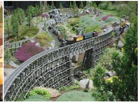
Baker & Grand Ronde RR (G, Outdoor)

Bring your best to share with everyone on Thursday and Friday; the awards will be presented at the banquet.