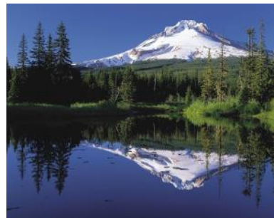
Mt Hood reflected in Mirror Lake

Many of Portland's best attractions can be accessed via our Light Rail system, MAX ( http://www.trimet.org ). The closest stop is just a short Uber ride from the convention hotel (Yellow line, Delta Park stop). From MAX, you can easily access all the best museums, parks, dining and shopping available in the metro area. Going further afield, there are several tourist railroad operators in Northwest Oregon and Southwest Washington. Within a less than two-hour drive, there are the wineries of the Willamette Valley and the scenic beauty of Mount Hood, the Columbia Gorge, and of course the ocean beaches. If all of this is too far for you to go, then simply board the cruiser docked at the hotel for an enjoyable tour of the Columbia River.