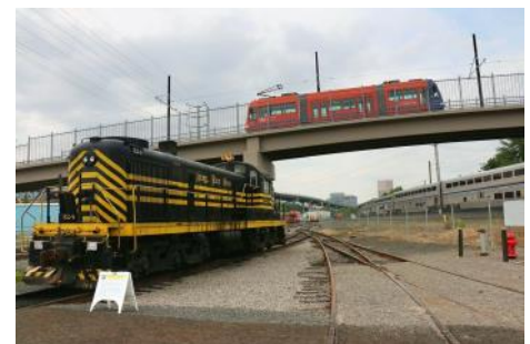
See you in Portland!

I hope we have whetted your appetite for the 2018 Stumptown Express. We are really looking forward to seeing you in Portland!