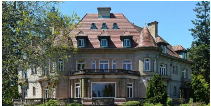
Pittock Mansion

Portland has many other activities to attract your attention. Why not turn your convention experience into a family vacation? Note that most Portland-area schools stay in session until mid-June, so you won't be competing with local families during your outings!