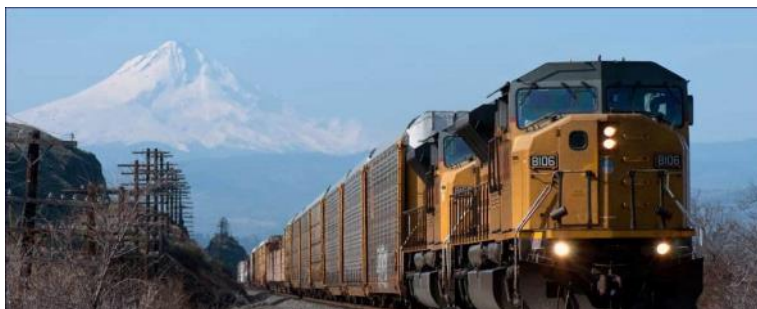
Stumptown Express is coming to Portland.

Portland, Oregon, is the site for this year's PNR convention, the 2018 Stumptown Express. The convention will be held May 30th through June 2nd at the Red Lion Hotel on the River at Jantzen Beach.