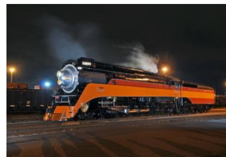
Oregon Rail Heritage Center's restored SP 4449

Two prototype tours are currently planned. First, on Friday, is a trip to the Oregon Rail Heritage Center ( http://www.orhf.org/oregon-rail-heritage-center/ ). The museum centerpiece is three steam locomotives: Northern SP No. 4449 (operational), SP&S No. 700 (undergoing its 15-yr. boiler overhaul), and Pacific OR&N (UP) No. 197 (being restored). In addition, there is the last Alco PA 1 (being restored), and several passenger cars that are regularly paired with SP 4449 and SP&S 700 in excursion service. This is your chance to see these beauties up close. Doyle McCormack will be our host for an exclusive talk before the venue opens to the public. We will then break into small groups for guided tours of the equipment and exhibits. This will be an exciting addition to Mr. McCormack's banquet speech that you don't want to miss!