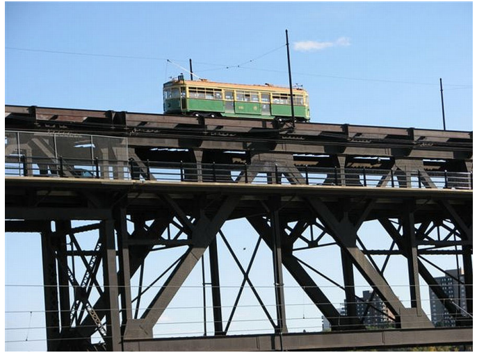
You can ride this streetcar from downtown Edmonton to the Strathcona shopping district and enjoy the spectacular views of the North Saskatchewan River valley from the top of the 96 year old High Level Bridge.

Whether you pre-register or sign up at the convention, please make sure you arrive early. Activities start right at 9 o'clock Thursday morning with the Lehigh Inland Cement tour and the first of 20 different clinics. The registration desk will open at 8 am. The complete convention schedule is at NorthernLights2009.ca , and click "Schedule." Changes are posted promptly. It is the Convention Committee's goal to offer you more activities than you can fit into your schedule. But whatever you choose to do, please make sure you leave some time to renew acquaintances and make some new friends. After all, isn't that what it's all about?