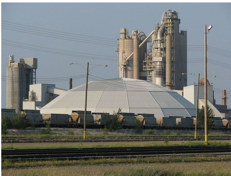
Some of the special hopper cars used to bring limestone to the plant have just been unloaded at the Lehigh Inland Cement plant in Edmonton. A special tour will show the inner workings of this huge industry.

If you like really big industries, you won't want to miss the bus to Lehigh Inland Cement on Thursday morning. This guided tour will show you the process of making Portland cement at the plant in northwest Edmonton. This is a very rail-oriented operation, with raw limestone arriving on unit trains from the quarry over 340 kilometres away and plenty of cement leaving every day in huge covered hoppers. Both