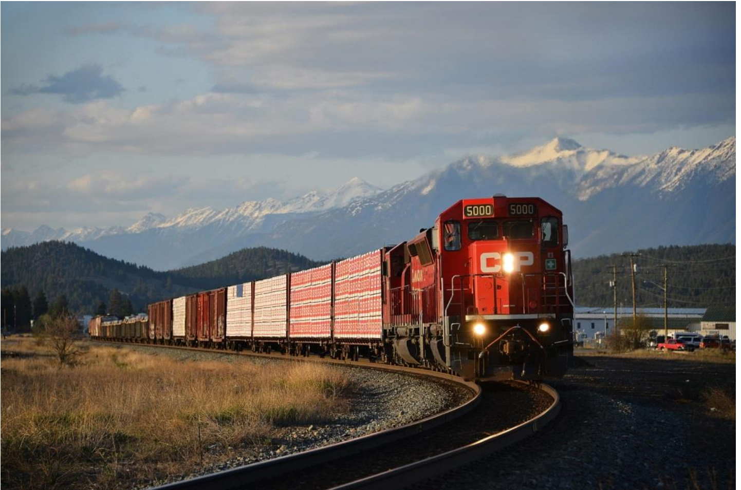
Multiple carloads of lumber from the Canfor sawmill in Radium ride behind CP 5000 on the Windermere Sub switcher on May 2, 2018. One of the prototype tours will take modelers to visit the mill.

The registration desk will open Wednesday morning. All the latest details on the Convention are posted on the website: https://www.kootenayexpress2019.ca/ . It is the Convention Committee's goal to offer you more activities than you can fit into your schedule. But whatever you choose to do, please make sure you leave some time to renew acquaintances and make some new friends. After all, isn't that what it's all about?