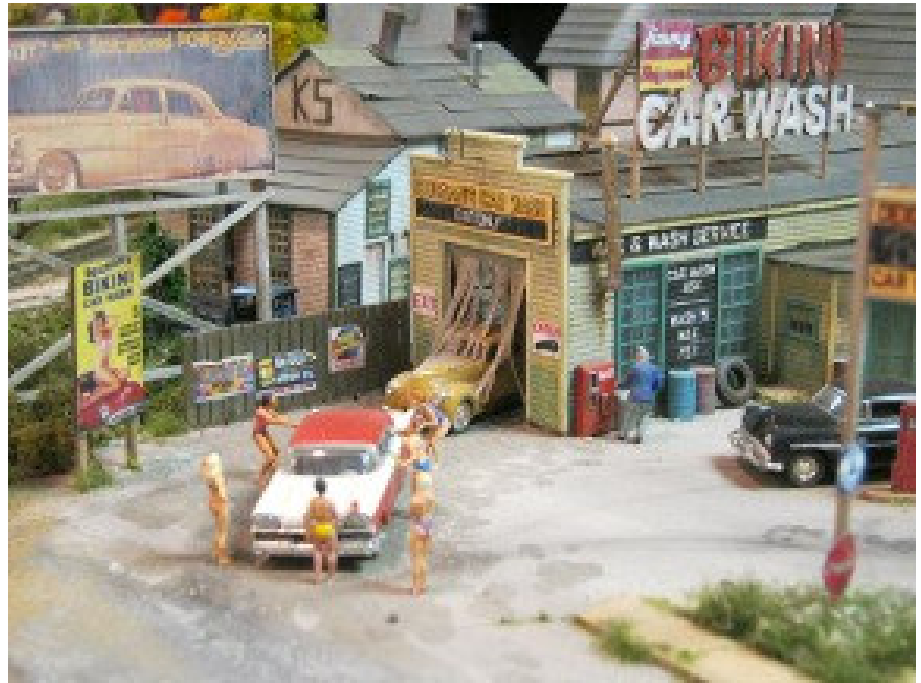
Bikini Carwash on Jimmy Deignan's layout

The organizers have four clinics lined up focusing on improving your modeling. Participants are also encouraged to bring models for the Show and Tell sessions so you can ask questions and learn about others' modeling techniques. There will be an opportunity to have your models evaluated for the Achievement Program too.