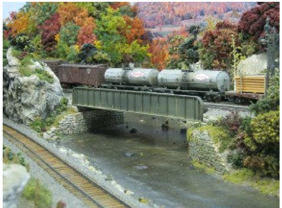
A streamside scene on Dick Elwell's layout

the Glenmore Inn. The Flea Market promises to bring out many treasures for sale at bargain prices. The Mini-meet will