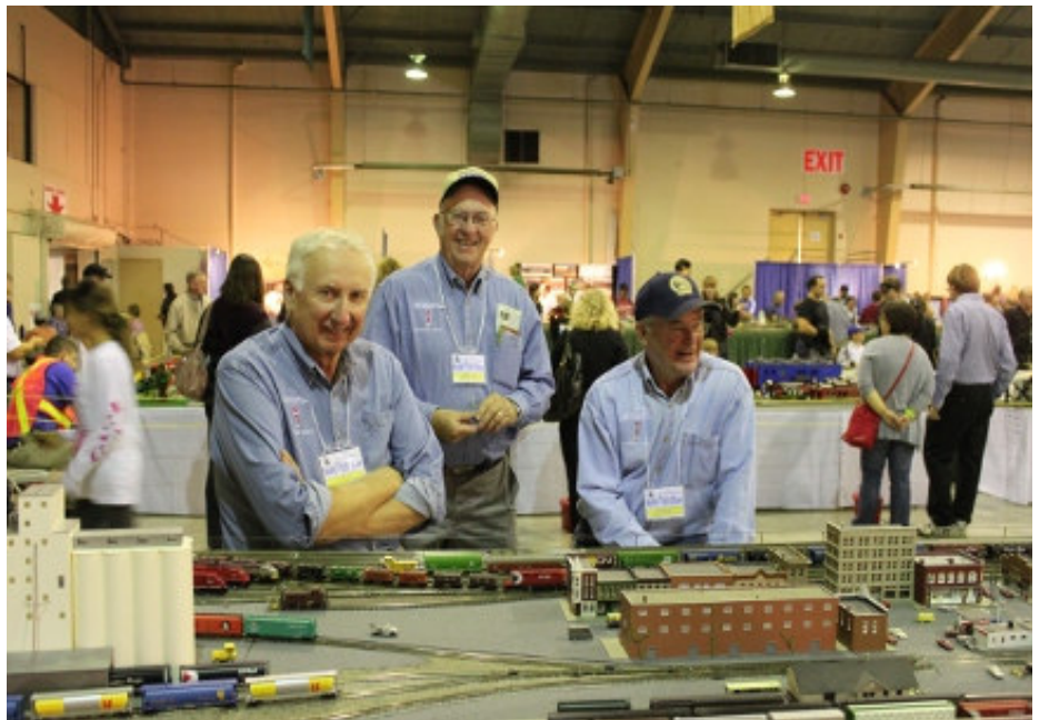
Southern Alberta Model Railroad Club members at GETS September 2011

I'd like to thank the EMRA for handling the folding, stuffing, and addressing the paper copies of the Highball! The members dive into the task with enthusi-