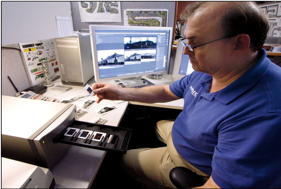
Each of the 100,000 photos in the Kalmbach Library must be digitized, and important metadata added to each scan to aid in fast, efficient user searches. It's a time consuming process that will be an invaluable resource to members.