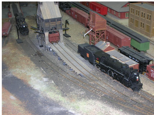
A photo from Doug's home layout.

This slide and movie show has only been given once in Calgary in 1973 after his trip to South Africa in November of 1972. The length of the show will be approximately 1 ½ hours plus additional time for questions after the show.