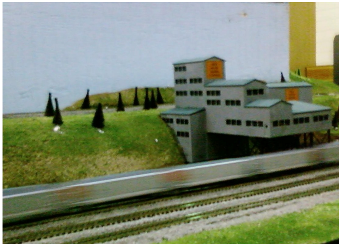
A coal drag speeds past a coalmine on the editor's portable layout at the RMRS.

Over at the Regina Model Railroad Club things are not going quite as well. Our landlord, The Elks, have given us notice to vacate our layout room as of July 1, 2008. Where we had been busily building a new layout based upon the CN mainline between Melville and Regina the club now faces an uncertain future. We've been considering a number of interim measures. But we are extremely busy packing and tearing down the layout that was complete through the tracklaying stage.